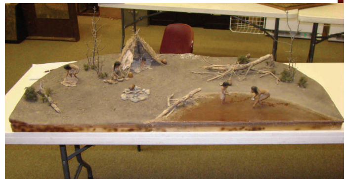
Figure 2. Bottom Insert for Indian Display.