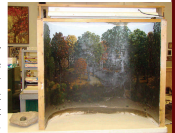
Figure 1. Indian Display with Stone Mashing Bowl.

The Indian Creek Nature Center would like a base cabinet to be built for the display. The display would then be enclosed and set on the base cabinet. The unit should be wide enough to include display shelves on the left side. The upper portion would also have a glass or Plexiglas cover to keep out dust and hand contact.