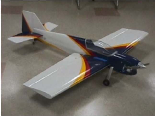
By the end of the evening Steve's airplane was ready to fly.